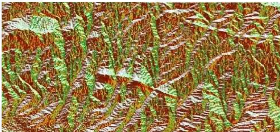
Figure 2. Aspect card based on 3D model

After the creation of these maps, the images taken in 3 periods were converted to NDVI values in the form of three-dimensional models and slope and aspect values. On this basis, the extent to which the calculated NDVIs of the base plot were related to slope, aspect, and height was calculated (Figure 3).