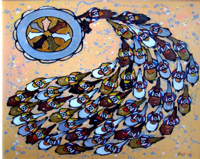
Fig.1. Triptych "Ulok". 95x95 sm. Oil on canvas. 2010 year. Fragment.

solutions of the canvases, the artist's attitude to the surrounding reality is expressed, in some works there are open and warm colors, in others, on the contrary, cold. The artist seems to live in his own unique world, a small space.