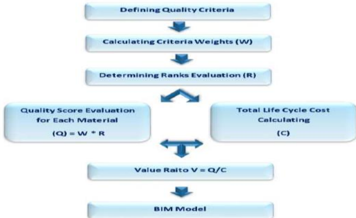
Figure 1. Research Methodology Process.

Then the price was added to these doors to produce our value, and the more excellent value in the results indicates the best material chosen in this research. These theoretical results in building information systems were linked to facilitate selection processes in another scientific paper explaining this environment's application.