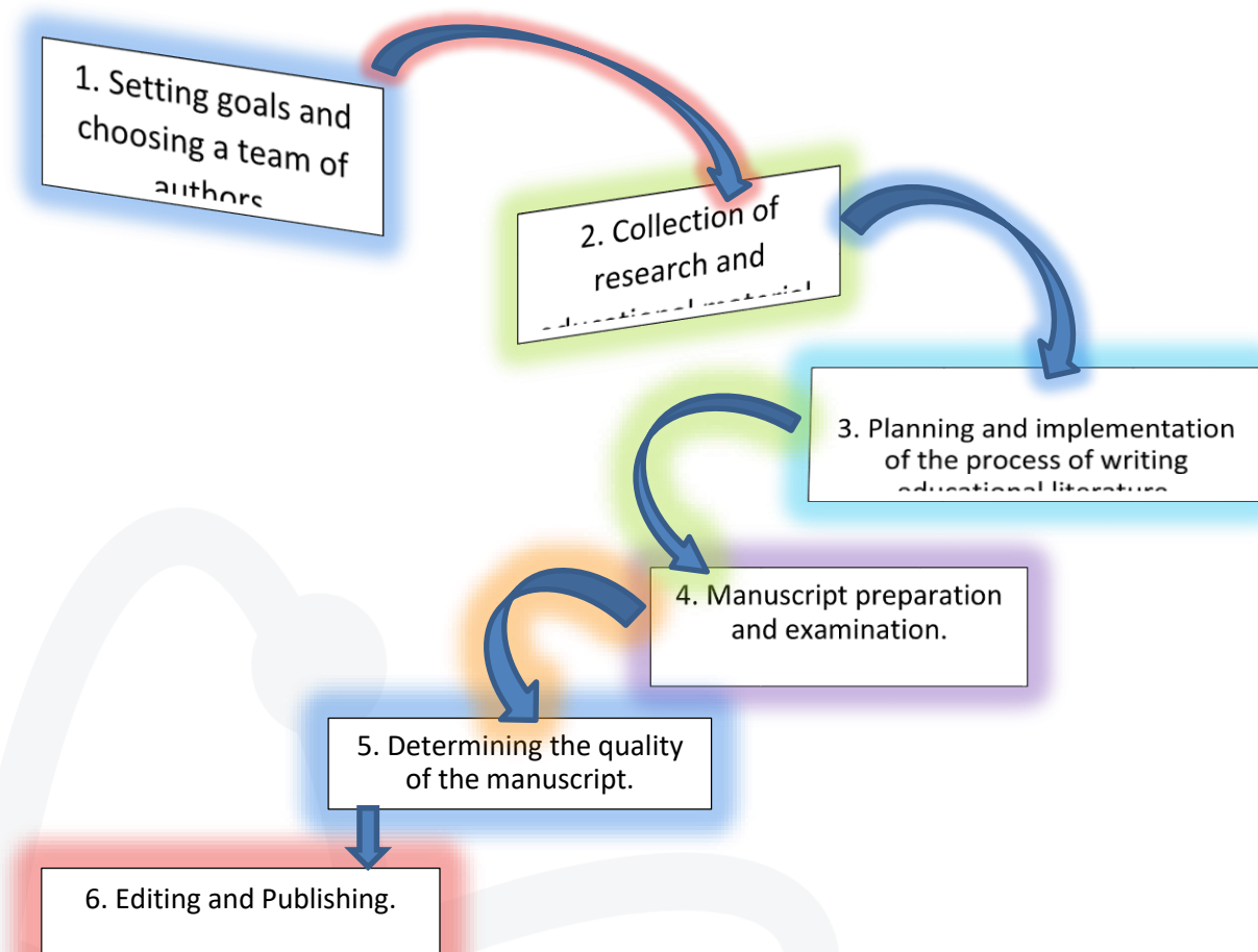
Figure 2. Scheme of stages of creation of electronic educational literature

Some authors describe the stages of creating educational literature in the following order [5]: