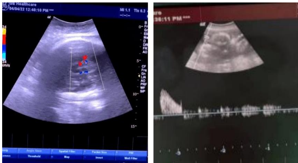
Ris. 4. Hemodynamic disorders of the fetoplacental complex (UA, PA) on Doppler analysis

We started our analysis of the results of a placental blood flow doppler study by comparing vascular resistance indicators in the main arteries.