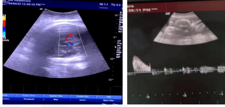
Ris. 4. Hemodynamic disorders of the fetoplacental complex (UA, PA) on Doppler analysis

We started our analysis of the results of a placental blood flow doppler study by comparing vascular resistance indicators in the main arteries.