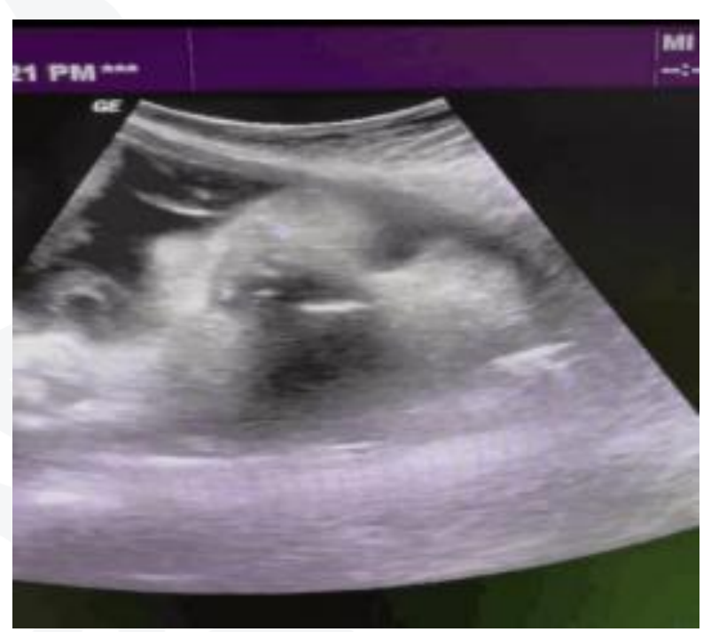
2. Pregnant N. (birth history No. 1890). Diagnosis: Pregnancy II 33.4 weeks. FGRSII II degree. Circulatorye blood circulation disorders of the fetoplacental system are 2b degrees. The buccal coefficient is 8 mm.

To optimize the antenatal diagnosis of FGRS in the fetus, we developed ultrasound markers, and then evaluated their effectiveness in the diagnosis of: