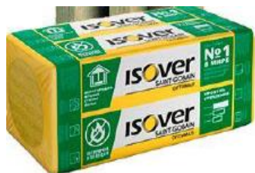
Figure 3: ISOVER FASADE