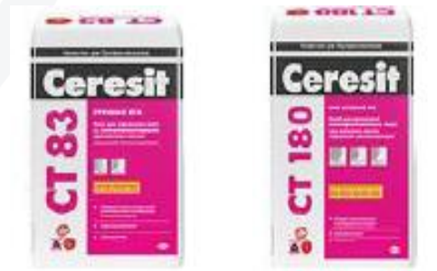
Figure 2: Heat protection layer primer applications.