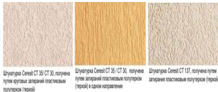
Figure 9: decorative paint