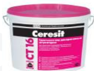
Figure 8: Primer for decorative plaster