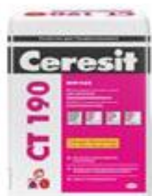
Figure 6: Plaster and glue mixture