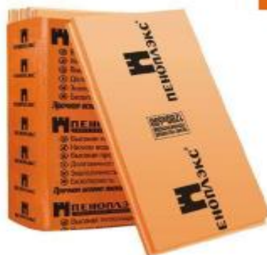
Figure 4: PENOPLEX DOUBLE КАМФОРД