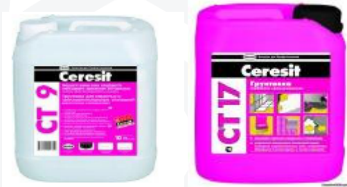
Figure 1: Load-bearing wall