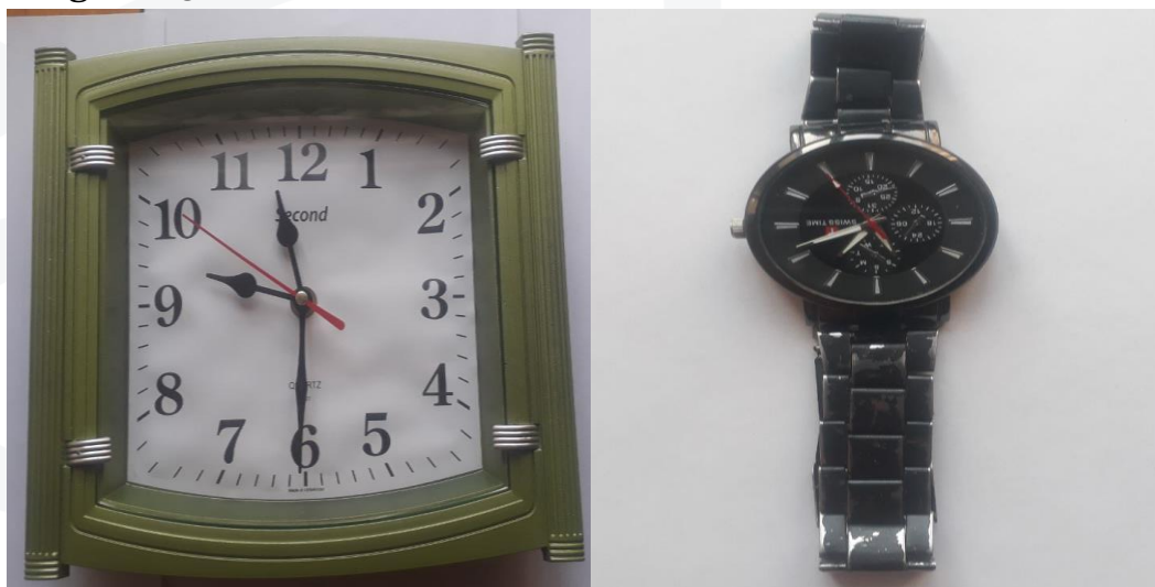
Figure 3. A sample view of a clock showing the time in two different places at the same time on offer.

An example of a watch made by the author using the modifications suggested above is shown in Figures 3.