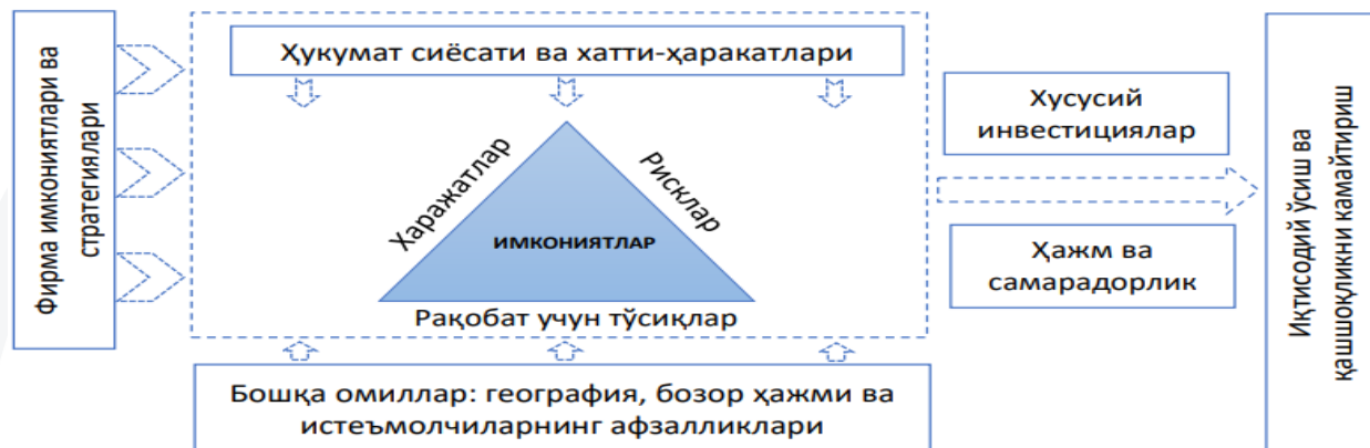
Figure 1 . Investment environment and its organizational elements

Investment environment is this of firms efficient investment input, work seats Create and expand possibilities and encouraging factors sure defines places is a set. In this the government policy and actions, costs, risks and competition barriers such factors have a strong influence. ( Fig . 1 )