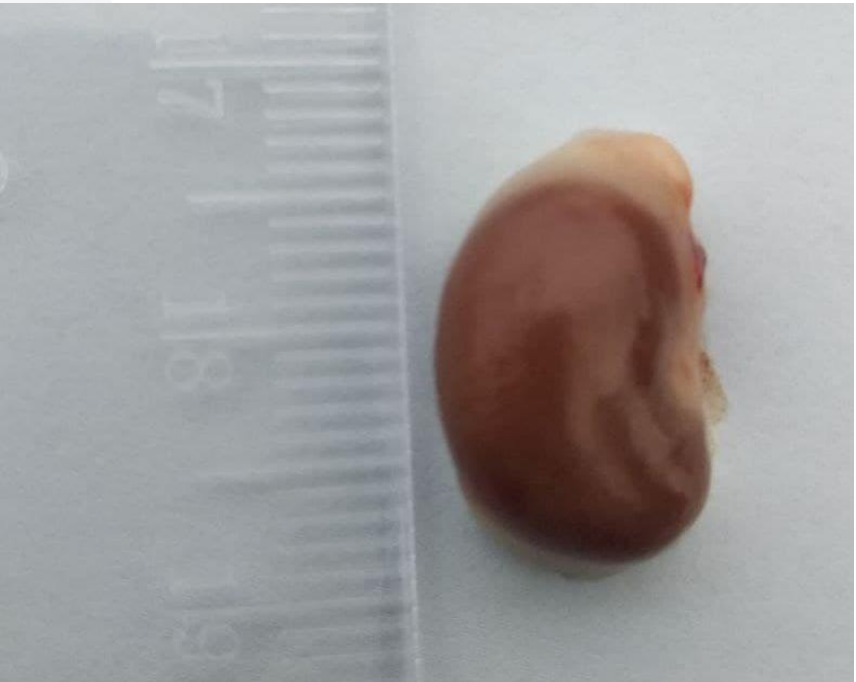
Figure 1. Renal morphometry in white rats 3 months after moderate to severe traumatic brain injury .

From the macroscopic point of view , the kidneys of the 3-month-old white rats of the experimental group are red-brown and bean-shaped located in the lumbar region, covered with a smooth and shiny capsule from the outside, no pathological changes visible from the macroscopic side were observed . Only a slight swelling was found.